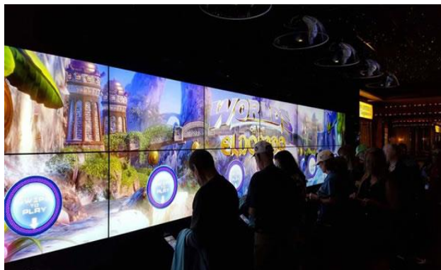
The Worlds of Eldorado game from Zero8 - installed at the Eldorado Resort and Casino - is especially designed with the intent to engage the hard to reach millennials.

For this exact reason ZoomAway has entered into a letter of Intent with Zero8 that will grant the Company the exclusive, worldwide rights to the sales and marketing of the Zero8 Free-to-Play Mobile Game platform and the Zero8 Kiosk platform.