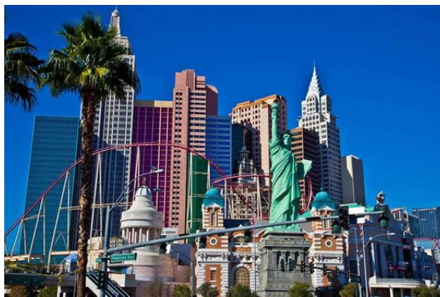
In 2016, the Company acquired over twenty five new White Label customers, including ten hotel casino properties in Las Vegas.

The Company aims to earn gross profit margins between 17% and 24%, well above the travel industry's average.