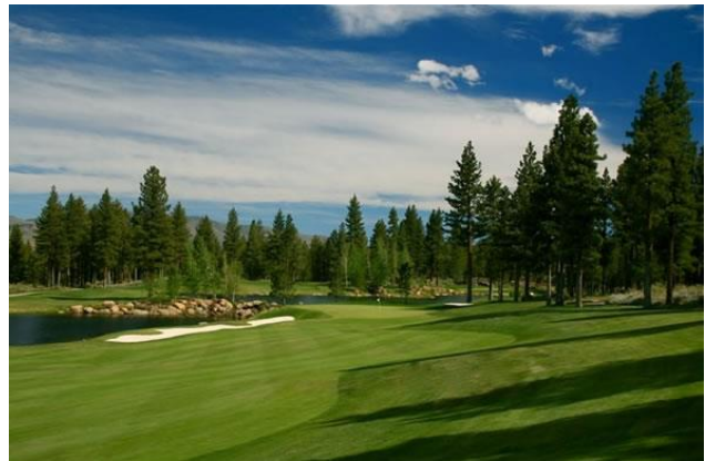
The Barracuda Championship, held at Montreux Golf & Country Club in Reno/Tahoe, is one of 47 full-field stops during the PGA TOUR Season.

In October 2016, the Company announced that its White Label technology booking solution was launched at the Poppy Hills golf course in Pebble Beach, California. The technology platform has since been embedded in the Poppy Hills website, www.poppyhillsgolf.com , and allows customers to make lodging reservations and book tee times all at once.