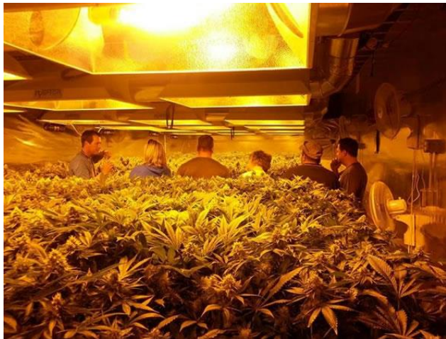
Ever more operators offer customized tours for group and individuals who want to take part in the booming cannabis culture.

marijuana tour package that includes staying in a vape-friendly downtown hotel room, a cooking-with-cannabis class, and a visit to the Denver Botanic Gardens for the Chihuly glass exhibit.