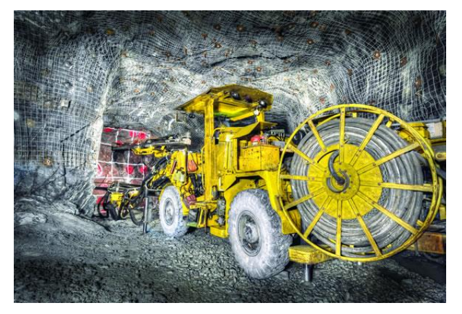
Underground operations at Nyrstar's Middle Tennessee Mines.

This royalty entitled Globex to a 1.4% royalty when LME zinc prices were at or over US$1.10 per lb. and a 1% royalty when the zinc price were between US$0.90 and US$1.09 per lb. Since 2010, Globex received royalties from Nyrstar totalling more than US$6 million.