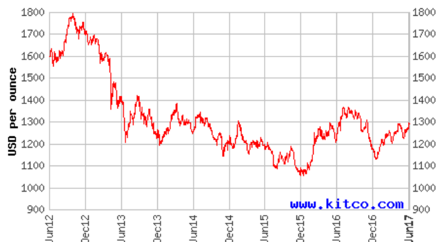
5-year gold chart.

Although, as noted above, Globex' number of properties typically grows during down years for commodities, its revenue significantly increases when metal prices point upwards. Therefore, it's important to look at the overall market expectations for a wide number of commodities.