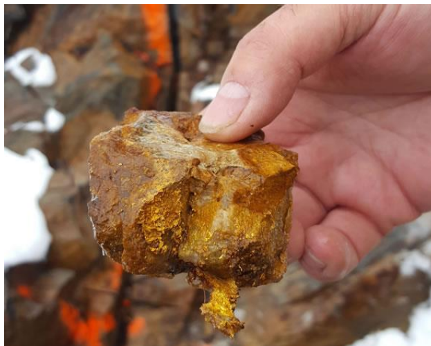
Extremely high-grade visible gold grab sample from the Montalembert property.

Globex shall receive a 6% GMR (9,000 ounces) of the first 150,000 ounces of all precious metals (Au, Ag) recovered from the property and a 3.5% GMR from all production beyond the initial 150,000 ounces of recovered precious metals. In addition Globex will receive 50% of all museum grade gold samples.