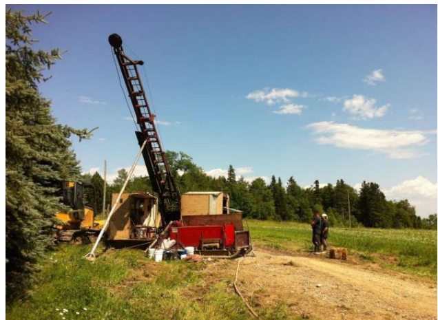
Drilling activity at the Woodstock Manganese property.