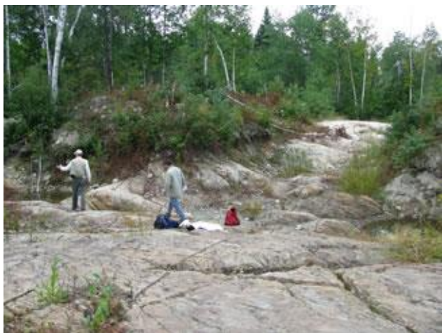
The Duquesne West property has an Inferred Resource of 853,000 oz of gold.

The Duquesne West Property is comprised of 60 claims totalling 929 ha located 32 km northwest of the mining town of Rouyn-Noranda and 10 km east of the town of Duparquet, Quebec. The property is also located 4 km east and along strike from the past producing Beattie and Dorchester mines, which produced 8.4Mt @ 3.5 gpt Au and 1.2Mt @ 9.3 gpt Au, respectively, and 3.5 km west of the past producing high grade Duquesne Mine which produced 199,912 t @ 10.3 gpt Au.