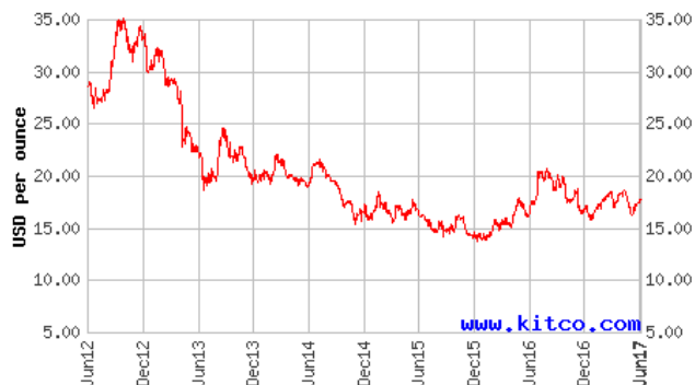
5-year silver chart.