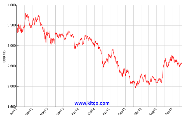
5-year copper chart.

Swiss investment bank UBS looks for silver to average $18.60 in 2017. The bank's analysts suggest silver may largely be driven by moves in gold. Still, "we think silver's links to economic activity via its industrial-demand component should help its relative performance to gold during periods when markets are optimistic about growth and risk."