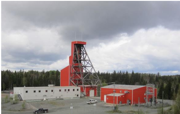
Part of the Francoeur mine.

A mineral resource (Measured and Indicated 320,000 t @ 6.47 gpt Au (66,600 oz Au) and Inferred 18,000 t @ 7.17 gpt Au (4,150 oz Au)) has been identified by Richmond in the West Zone of the Francoeur mine using a cut-off grade of 4.3 gpt Au and a gold price of USD $965. The resource remains open at depth and is accessible by shaft and underground ramp.