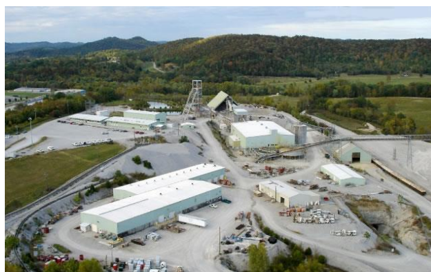
Nyrstar's Mid Tennessee mine is scheduled to restart operations, which should generate over $1.5 million in royalties for Globex annually.

Consequently, Globex anticipates receiving royalty payments from the mine of over $1.5 million per year at current zinc prices.