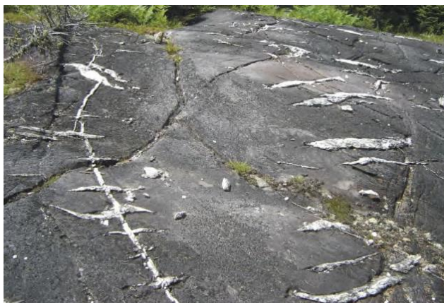
View of A Zone Talc-Magnesite Deposit with Quartz Veinlets in Outcrop.

A Preliminary Economic Assessment (PEA) conducted on the property by Micon in 2012 indicated an after-tax Net Present Value (NPV) of $258 million at a discount rate of 8%, and an after-tax internal rate of return (IRR) of approximately 20% and a payback period of 5.8 years on the discounted cash flow.