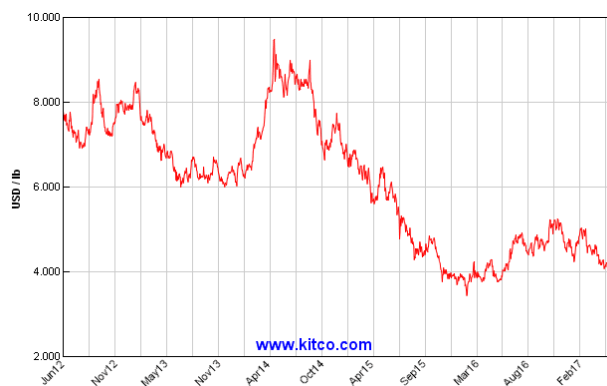
5-year nickel chart.

underperforming market needs in 2017." The company also cited Wood Mackenzie, which expects a deficit of 100,000 metric tons in 2017.