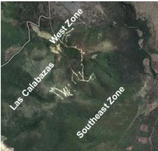
Satellite image of the Cerro Jumil property in Mexico with its three gold dominant zones: the Southeast, Las Calabazas and the West Zone. Gold associated silver mineralization is mainly concentrated in the West and Las Calabazas Zones.

Starting in 2005, Esperanza initiated a 1,200 metres drill program testing targets in and around the West Zone. A total of eight drill holes were completed, in which the Company discovered gold and silver mineralization. This was followed by the discovery of extensive surface gold mineralization in the Southeast Zone, a few months later.