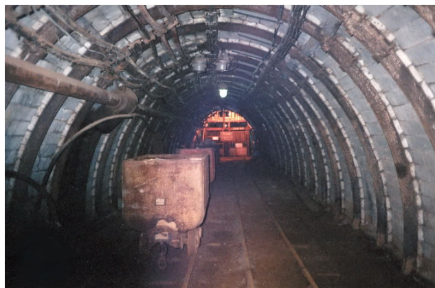
One of the four underground tunnels at the Strieborná property.

Process test work on a bulk sample from the Strieborná vein using the process developed by Sunshine Mining and Refining Company indicated that 90-95% of the minerals bearing silver and copper can be recovered by conventional flotation. Hydrometallurgical treatment of the concentrate can then be used for selective removal of antimony, arsenic and mercury. The residual concentrate containing the silver and copper may be sold to independent smelters.