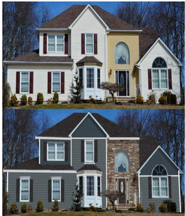
Renoworks’ visualization technology gives contractors and remodelers the advantage to significantly grow sales and profits by simply envisioning homeowners’ remodeled home before starting a project. Above, an uploaded photo of a house. Below, a design created of that same house with Renoworks Pro Visualization.

The Company’s primary focus is on building product manufacturers. However, it does have several significant clients that are distributors, retailers, and contractors. Some of the Company’s top clients are Royal Building Products, Sherwin Williams, Saint-Gobain (CertainTeed), Ply Gem, Jeld Wen, Andersen, Pella, Menards, ProVia, and Home Hardware.